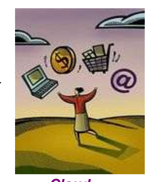
Cloud Computing: All the hype, but who do you trust with your business data?

In a short answer, any application which runs outside your home or business on systems which you do not manage. A few examples of this are email hosts such as Gmail or Hotmail. Your local computer uses a web interface or email application like Outlook or Windows Live Mail to communicate to the email servers hosted at Google or Microsoft. The advantage to "cloud hosted" email is that your company isn't responsible for maintaining or backing up these systems, nor manage the servers or their connection to the internet. On the flipside, if you've ever tried to contact these companies to help you recover a deleted message, you'll find it very difficult, if not impossible. In this example, an internal email server managed by your IT may be restored to a prior day or even local Outlook PST extract files could be available. For home users and smaller offices, hosted email by "the cloud" is a no-brainer, especially when considering the lack of in-house technicians, expensive email virus scanners and more.